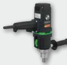
EHB 20/2.4 1150 W; 250/450 rpm Ø 20 mm in steel