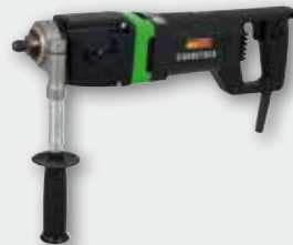
EHD 2000 S 1.700 W; 0-1.000/0-2.000 rpm Ø 32-132 mm