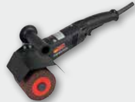
ESM 1310 1.300 W; 1.300-3.050 rpm Ø 120 mm