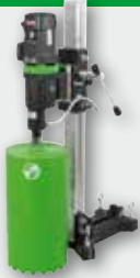
DBE 250 R 2500 W; 360/850 rpm Ø 52-250 mm