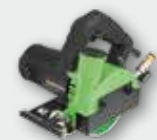
EDS 125 1.250 W; 12.000 rpm; Ø 125 mm max. cutting depth 36 mm