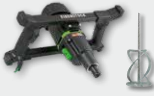
EHR 20/2.6 S Set 1300 W; 0-250/0-450 rpm Ø 140 mm; up to 50 kg mixture