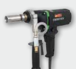
END 1550 P 1.500 W; 1.800-4.400 rpm Ø 6-68 mm (opt. 50 mm)