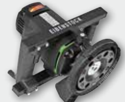
EBS 1802 SH 1.800 W; 10.000 rpm Ø 125 mm