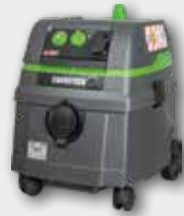
DSS 25 M max. 1400 W; automatic filter cleaning; tank volume 25 l