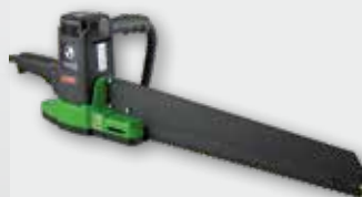
EDB 480.1 1800 W; 1500 stroke rate cutting length 480 mm