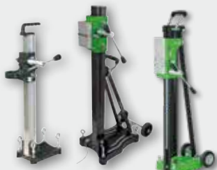
other models on request