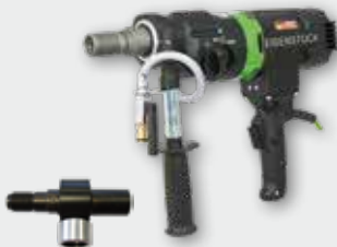
PowerLine PLD 182 NT 2.300 W; 0-520/-1.250/-2.700 rpm Ø 12-182 mm