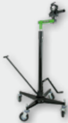
EBW 2300 1460-2300 mm; with add. machine arm 550-1460 mm (accessory)