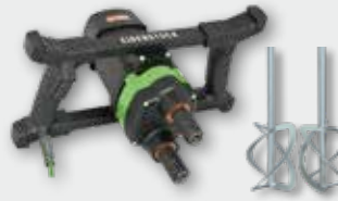
EZR 23 R R/L Set 1800 W; 200-530 rpm Ø 230 mm; up to 80 kg mixture