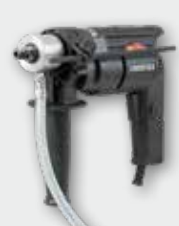
END 712 P 700 W; 0-8.000 rpm Ø 3,5-12 (18) mm