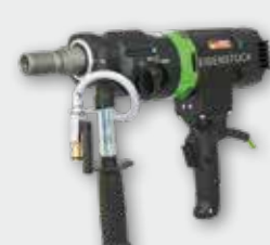
PowerLine PLD 182 2.300 W; 0-520/-1.250/-2.700 rpm Ø 12-182 mm