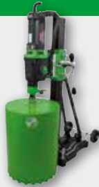
DBE 352 3000 W; 230/500/1030 rpm Ø 42-352 mm