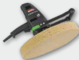
EPG 400 500 W; 0-60 rpm Ø 370 mm