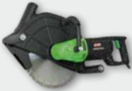
ETR 350/ETR 350 P 2700 W; 2200 rpm; Ø 350 mm max. cutting depth 130 mm