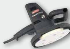
ETS 225 700 W; 0-1.450 rpm Ø 225 mm