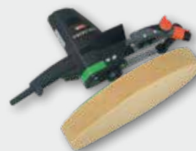
EPG 400 WP 500 W; 0-60 rpm Ø 370 mm