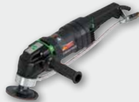
WPN 180 1.200 W; 1.500-2.800 rpm Ø 180 mm