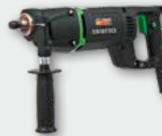
EHD 1500 1.500 W; 0-2.000 rpm Ø 32-82 mm