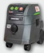
DSS 35 M iP max. 1600 W; permanent pulse filter cleaning; tank volume 35 l

Elektrowerkzeuge GmbH Eibenstock Auersbergstraße 10 08309 Eibenstock, Germany