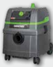
DSS 25 A/DSS 50 A max. 1400 W; automatic filter cleaning; tank volume 25 l/50 l