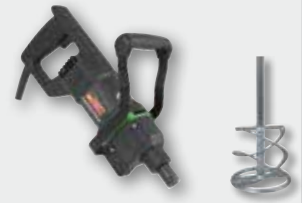
EHR 15.1 SB Set 1050 W; 0-450 rpm Ø 120 mm; up to 40 kg mixture