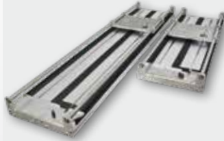
ETT 700/1200 for EDS 125 max. cutting length 700/1200 mm