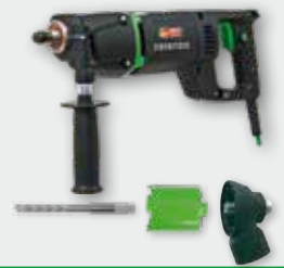
EHD 1500 Set 1.500 W; 0-2.000 rpm Ø 32-82 mm