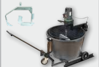
Automix 90 1500 W; 50 rpm 90 l; up to 80 kg mixture