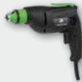
ESR 450 450 W; 0-4000 rpm Ø 5 mm; 1.2 kg