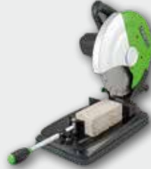
EST 350.1 2400 W; 3900 rpm; Ø 350 mm max. cutting depth 120 mm