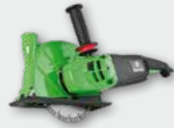
ETR 230 2600 W; 6500 rpm; Ø 230 mm max. cutting depth 65 mm