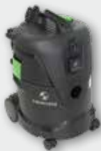
SS 1401 L max. 1250 W; Push&Clean filter cleaning system; tank volume 25 l