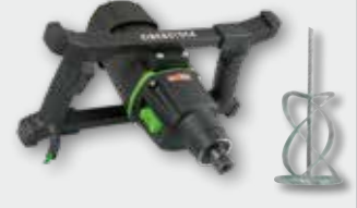
EHR 23/2.5 S Set 1800 W; 0-250/0-580 rpm Ø 180 mm; up to 80 kg mixture