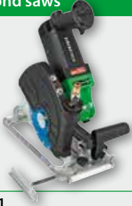
EDS 181 2300 W; 4300 rpm; Ø 200 mm max. cutting depth 63 mm