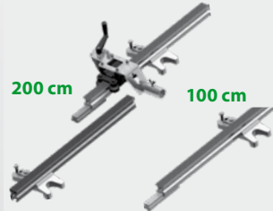
System of guide rails for ETR 350 P with crank feed for relaxing working