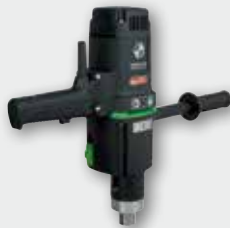
EHB 32/4.2 1700 W; 110/175/245/385 rpm Ø 32 mm in steel