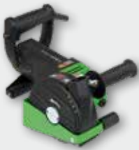
EMF 150.1 2.300 W; 7.500 rpm; Ø 150 mm 45 mm depth; 46 mm width