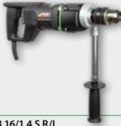
EHB 16/1.4 S R/L 1150 W; 0-450 rpm Ø 20 mm in steel