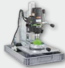
EFB 152 PX 1150 W; 180-1000 rpm Ø 6-120 mm