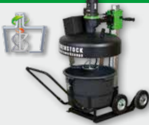
TwinMix 1800 T 1.800 W; 250/450 u. 20/36 rpm 65 l; 50 kg mixture