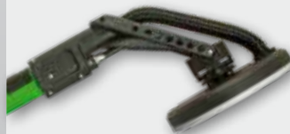
ELS 225.1 590 W; 1.050-1.600 rpm Ø 225 mm