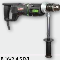
EHB 16/2.4 S R/L 1150 W; 0-430/0-760 rpm Ø 20 mm in steel