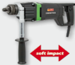
ESD 1801 1.800 W; 0-2.050 rpm Ø max. 90 mm