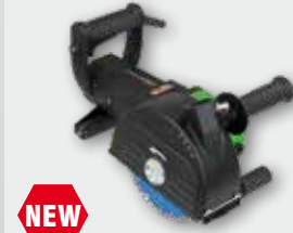
EMF 180.1 2.300 W; 2.200 rpm; Ø 180 mm 60 mm depth; 60 mm width