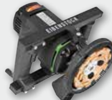
EBS 1802 1.800 W; 10.000 rpm Ø 125 mm