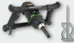
EHR 20.1 R Set 1300 W; 250-580 rpm Ø 140 mm; up to 50 kg mixture