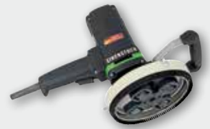
EPF 1503 1.500 W; 4.000 rpm Ø 140 mm