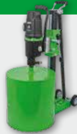
PowerLine PLE 450 B 3300 W; 180/400/780 rpm Ø 71-450 mm