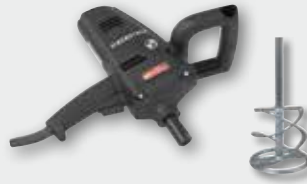
EHR 14.1 SK Set 960 W; 0-390 rpm Ø 120 mm; up to 30 kg mixture