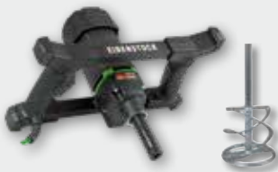
EHR 18.1 S Set 1100 W; 0-450 rpm Ø 120 mm; up to 40 kg mixture