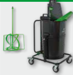
FloorMix 2300 2.300 W; 70/130/160/280 rpm 110 l; 150 kg mixture