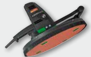
EWS 400 800 W; 0-85 rpm Ø 370 mm