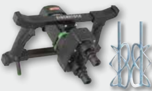
EZR 22 R R/L Set 1300 W; 140-400 rpm Ø 220 mm; up to 60 kg mixture