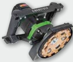
EBS 180 H 2.500 W; 8.500 rpm Ø 180 mm