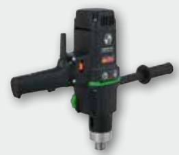
EHB 32/2.2 R R/L 1800 W; 60-140/200-470 rpm Ø 32 mm in steel